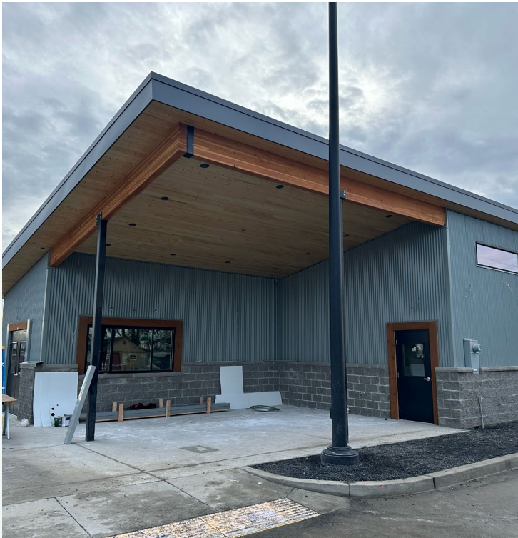
Swampy's BBQ Restaurant Coming Soon!