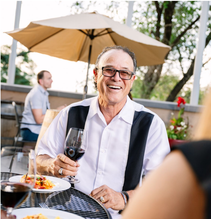
Public Restroom Art Wrap Coming Soon!