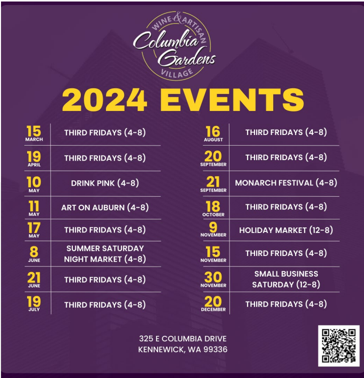
2024 Events Draft Starting March!