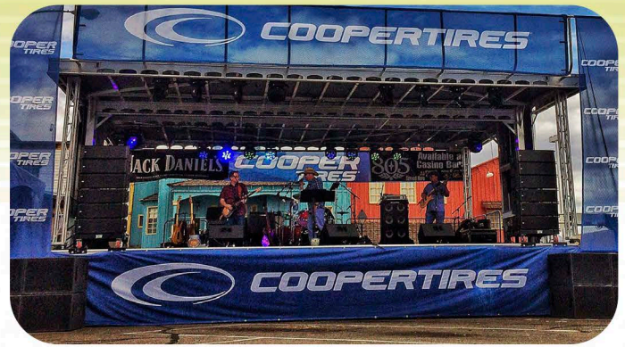
An example of the professional mobile stage coming to Clover Island in 2024.

The port will lease the stage to Clover Island Inn to attract concerts and other performers to Clover Island. This arrangement will ensure the island remains a destination for people seeking quality entertainment. And it will bring new visitors and increased spending to Kennewick's Historic Waterfront District.