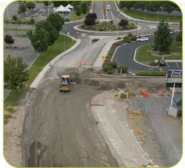
Port investments are supporting city projects like Richland's Center Parkway Extension.

The port commission also agreed to provide $40,000 to Benton City to assist with economic development projects, including updating the city's parks and recreation plan and zoning map, training staff to implement new design standards and developing recruiting materials. These efforts will help increase business opportunities for sites within the port district.