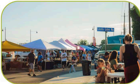
Summer Saturdays Night Market at Columbia Gardens

Events like the Classic Car Show, Yoga & Wellness Expo, ArtWalk, Summer Saturdays Night Markets, milestone celebrations and an E-Bike Expo brought hundreds of people to these vibrant destinations, helping increase visitor spending and encouraging additional private investment.