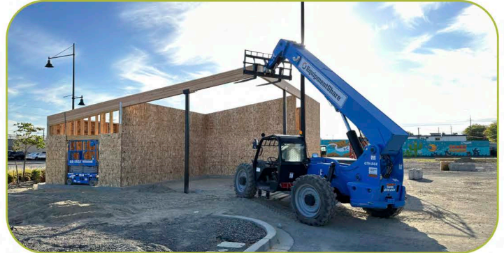
The artist's rendering will soon become a reality as construction on Swampy's BBQ's brick-and-mortar building at Columbia Gardens started in May.